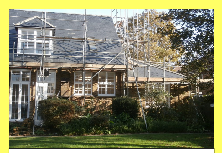
Work is almost complete on the new KCAH offices where we will operate alongside the Joel Community Services' 14-bed Night Shelter.